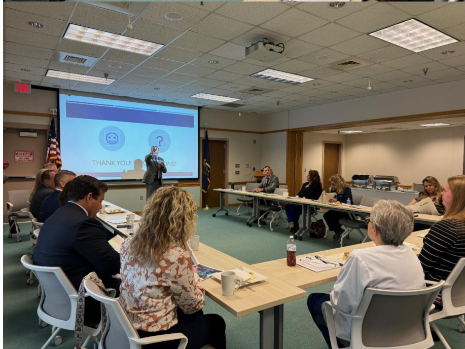
May's Quarterly Membership Meeting Was On Target